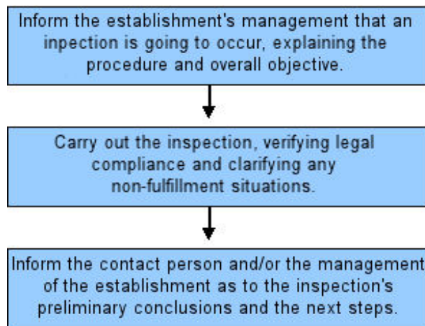
Figure 3 - Procedure for an in situ inspection.

Figure 3 illustrates an inspection procedure in diagrammatic form.